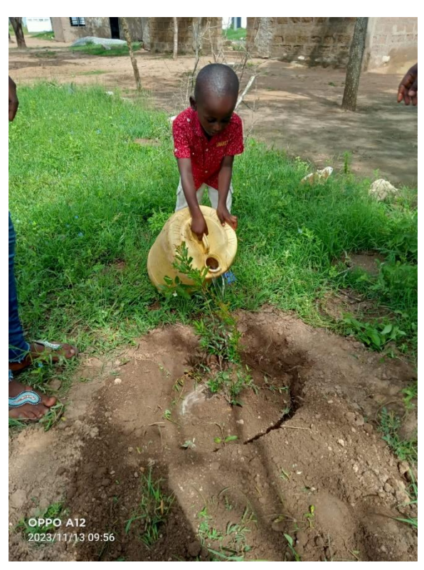
Jaffery centre, Mackinnon Road