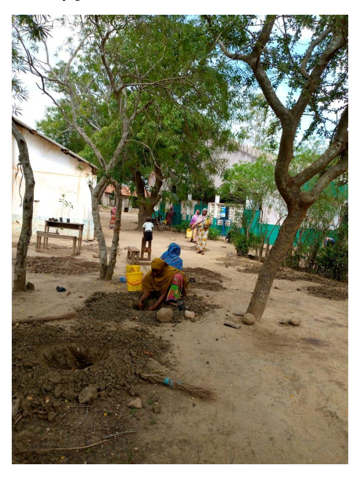
Women plant trees at the Ahlulbayt centre in Moyeni in 2020

There is an intricately close relationship between animal life and plant life. Most of the oxygen we breathe originates in the oceans from plants and plant-like organisms and trees produce approximately 30% of it. Trees are essential in the provision of shade and fresh nutrition and controlling the temperature and humidity in an area. They are vital in the prevention of soil erosion and slowing of water run-off among several other useful functions they perform.