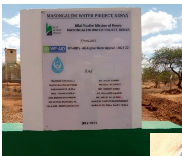
Figure 2: Plaque acknowledging donors

The government authorities were extremely positive and promised support to sensitize people to use the clean water for drinking and cooking. They also promised to provide security support for the equipment.