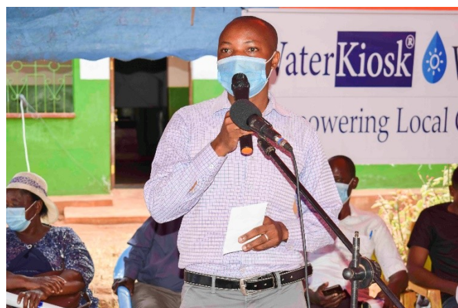
Figure 3: Government Official speaking at launch function