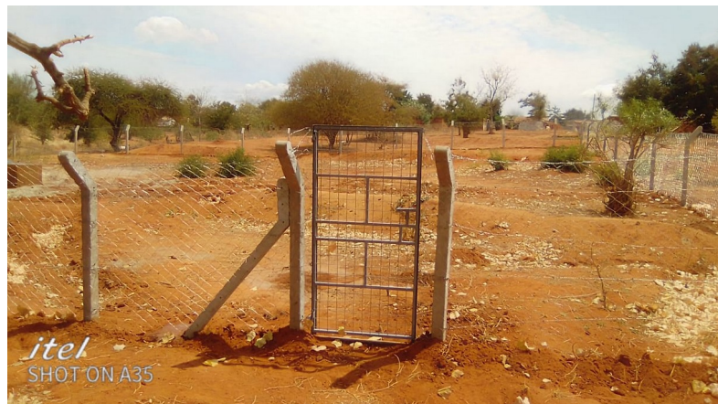
Figure 1 Fencing around the borehole site purchased by Bilal Kenya

The project was launched on 13 th July 2021, attracting a lot of attention with several local media houses covering the event in their vernacular online TV programs. Government officials were invited to officially inaugurate the plant and to create awareness on the day's theme - 'Clean Water and Health'. The locals currently only rely on the county water supply which is not clean and healthy. We also wanted the community to know that the project is for all people.