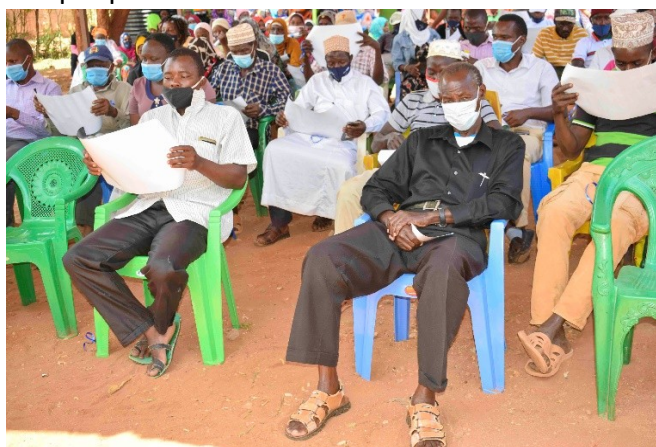
Figure 2: Launch function